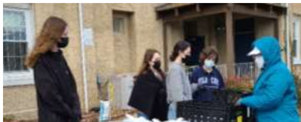
Thank you Phoenixville High School FBLA for helping with our food distribution on Friday in the cold!